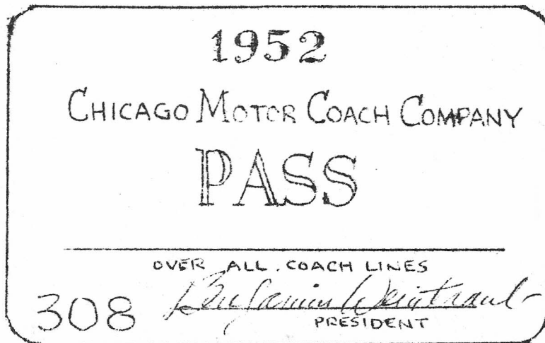
FACSIMILE OF CMC PASS (YELLOW)