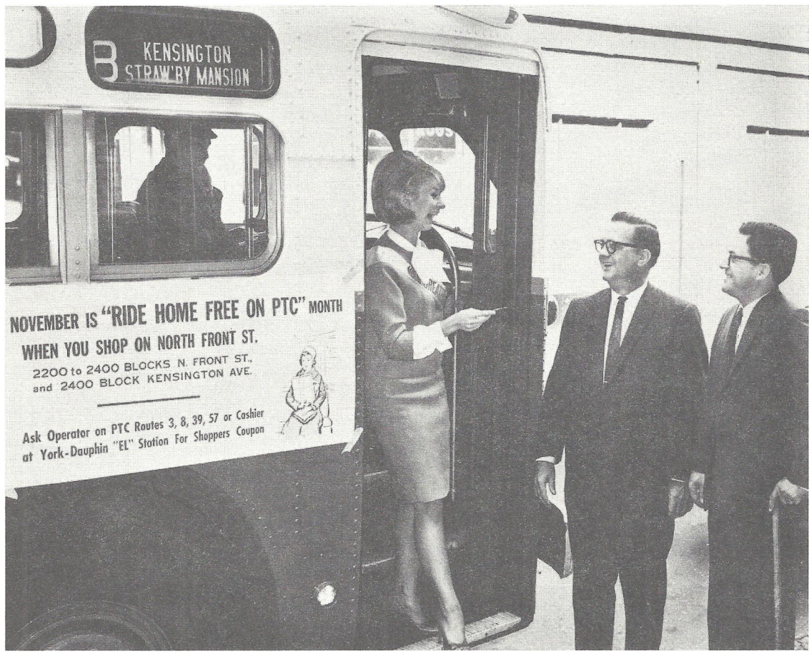
Officers of the North Front Street Business Men's Association launching their "Ride Home Free on PTC" shoppers' promotion project, for the N. Front Street-Kensington Ave. Shopping Area.