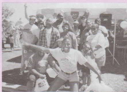
Chicago Avenue Garage 7th Anniversary celebrators look ready for fun.

Over 700 employees and their families attended the celebration, which was staged in the parking lot in front of the Garage. Fun activities included raffles, games, food and dancing. The CTA's mini bus provided rides around the facility and the City of Chicago provided a jumping jack for the children. A dunk tank was rented for the occasion and provided some entertaining moments.