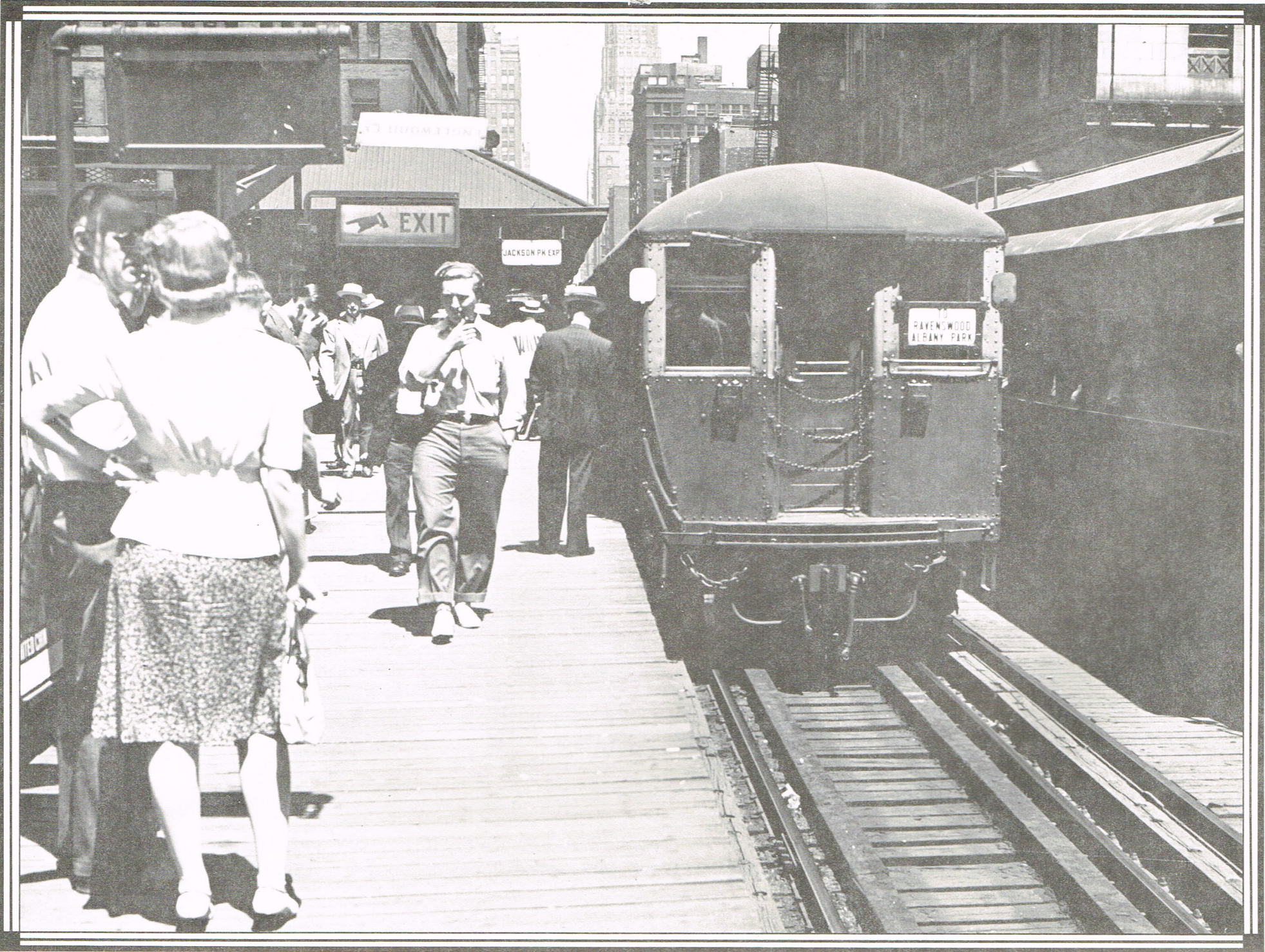
Before the State Street subway was opened in 1943, all trains from the North Side entered downtown on the Outer Loop. Semi-remote door controls adorn the front of this all-steel Ravenswood train at Quincy. Marker lights and a portable headlight were attached only for night service.