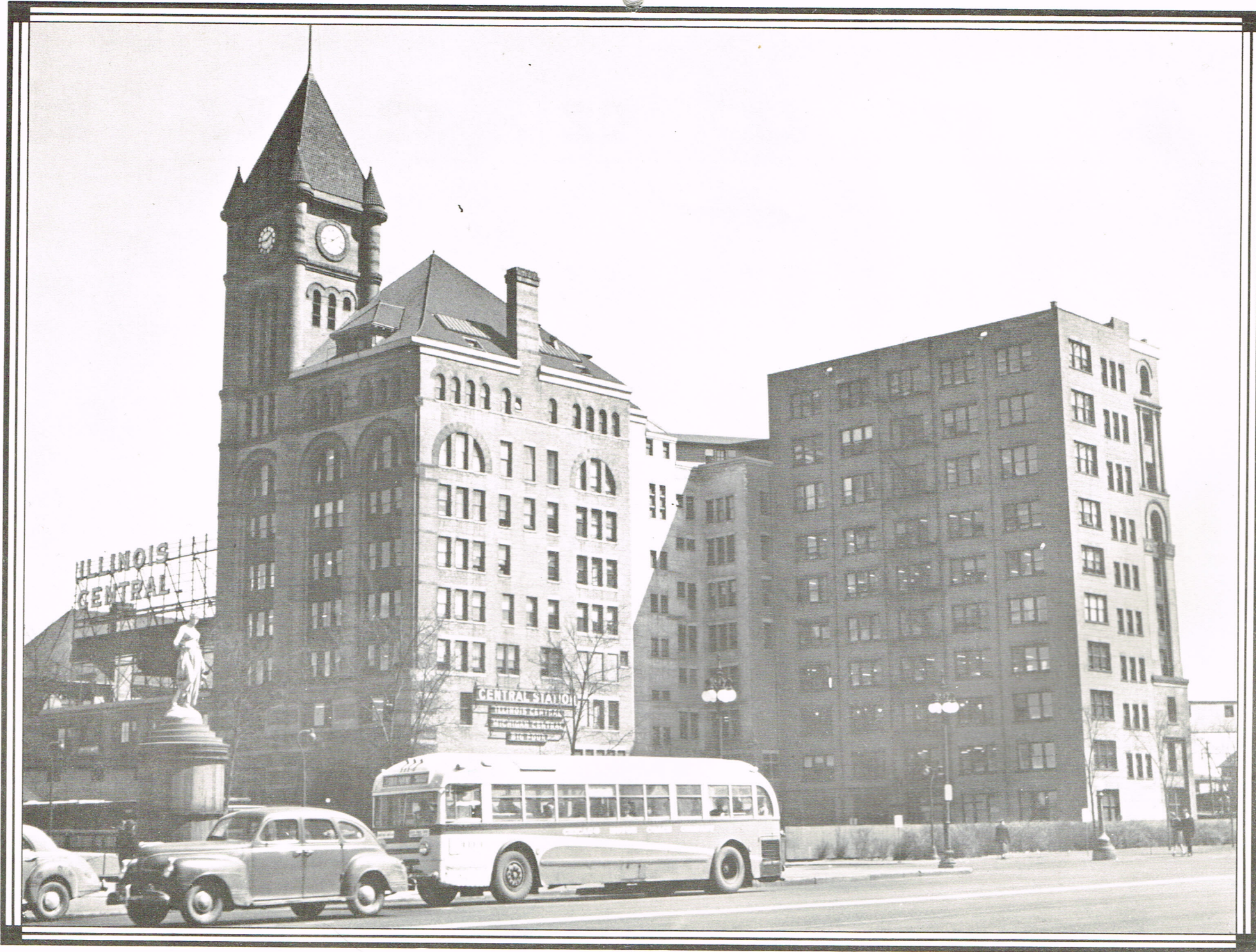
A 1939-model Yellow Coach on the Chicago Motor Coach Company's No. 3 South Parkway route heads north to a terminal at Michigan Bridge in this mid-1940's view at Roosevelt, where the Illinois Central Railroad had its offices and inter-city passenger depot from 1893 until 1974.