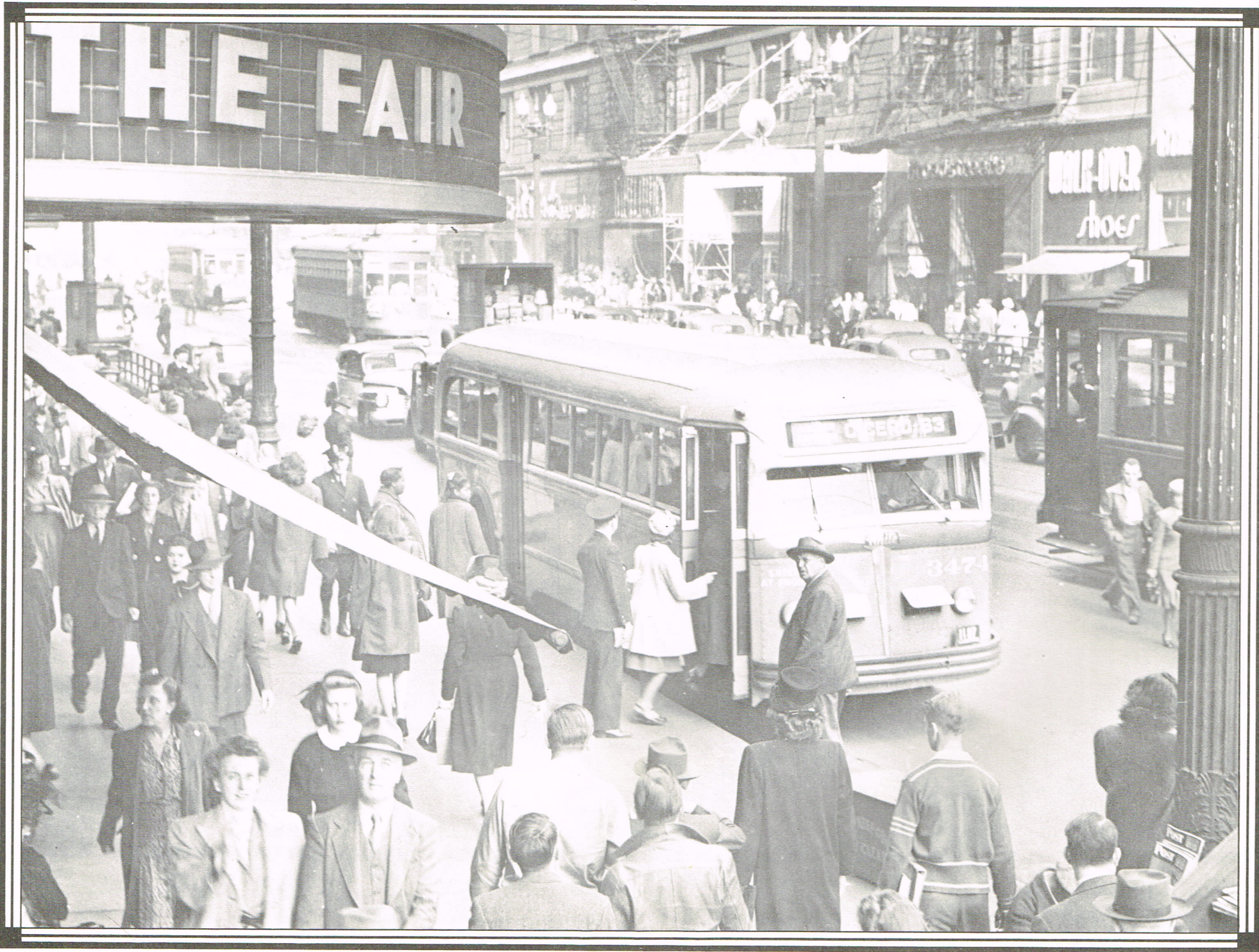
The transition from buses had just begun for Archer service in this 1946 view looking north on State from Adams Street. A 1904-model Brill-built Archer local streetcar pulls away southbound, while riders board a White bus on the newly established Archer Express route at the curb.