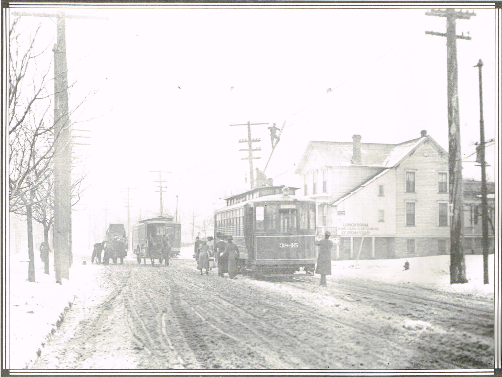
The motorman of an Evanston streetcar lowers the trolley pole to change ends in this 1911 winter scene looking south along Clark from Howard Street. In the distance is a Clark Street car on the same track, ready to head downtown and to the South Side along Wentworth Avenue.