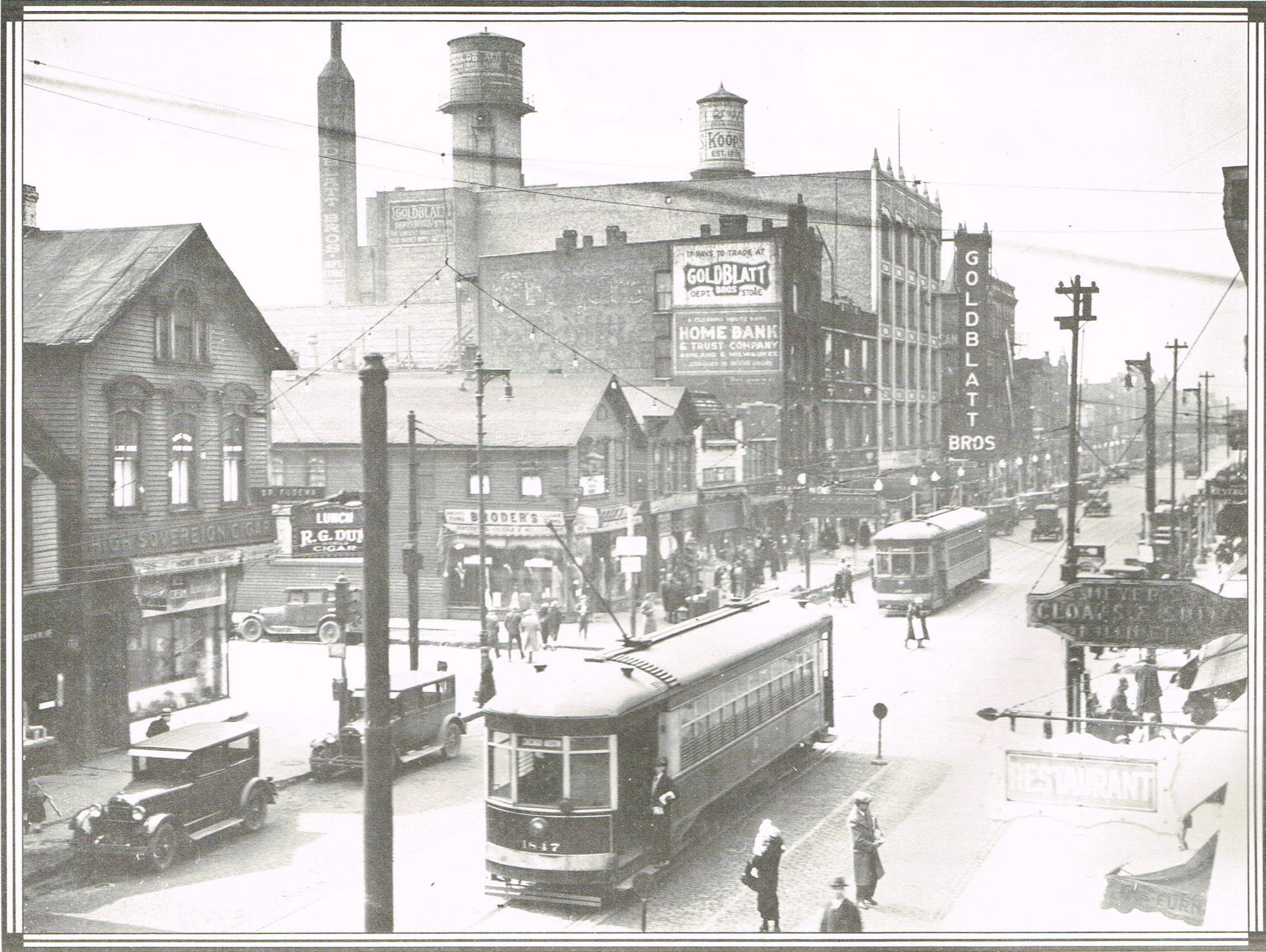
Ashland Avenue had not yet been widened in this early 1920's view looking west on Chicago Avenue. In the foreground, on its way to Austin, is Car 1847, which was built by Chicago Railways Co. in 1913. In the distance, west of Paulina, is the Metropolitan West Side 'L' structure.