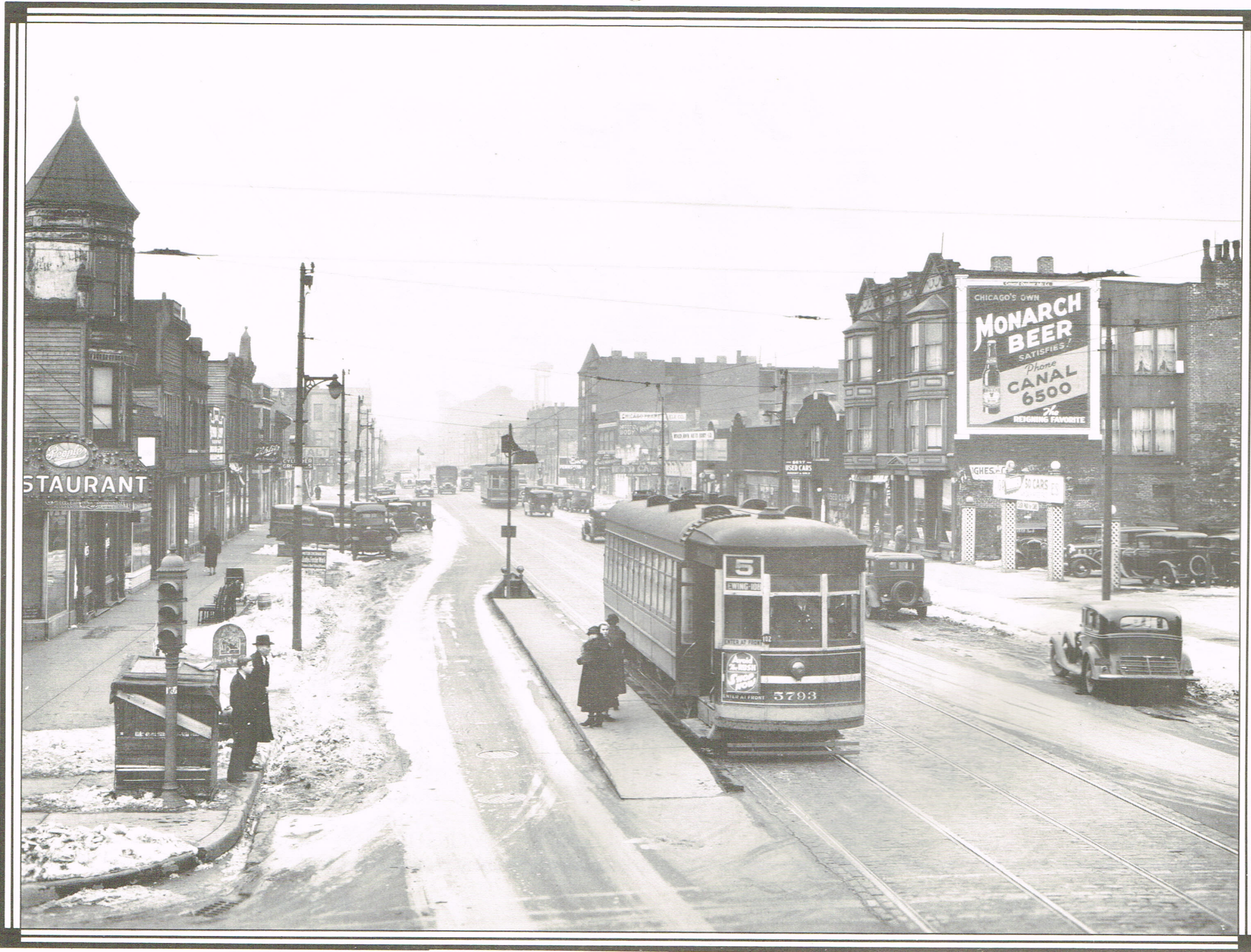
Brill-built streetcars like this 1912 model, heading south on Cottage Grove at 67th Street in 1934, were nicknamed "muzzle loaders," because riders had to board and alight at the front. At 71st Street, No. 5 cars entered South Chicago Avenue en route to a terminal at Ewing-108th.