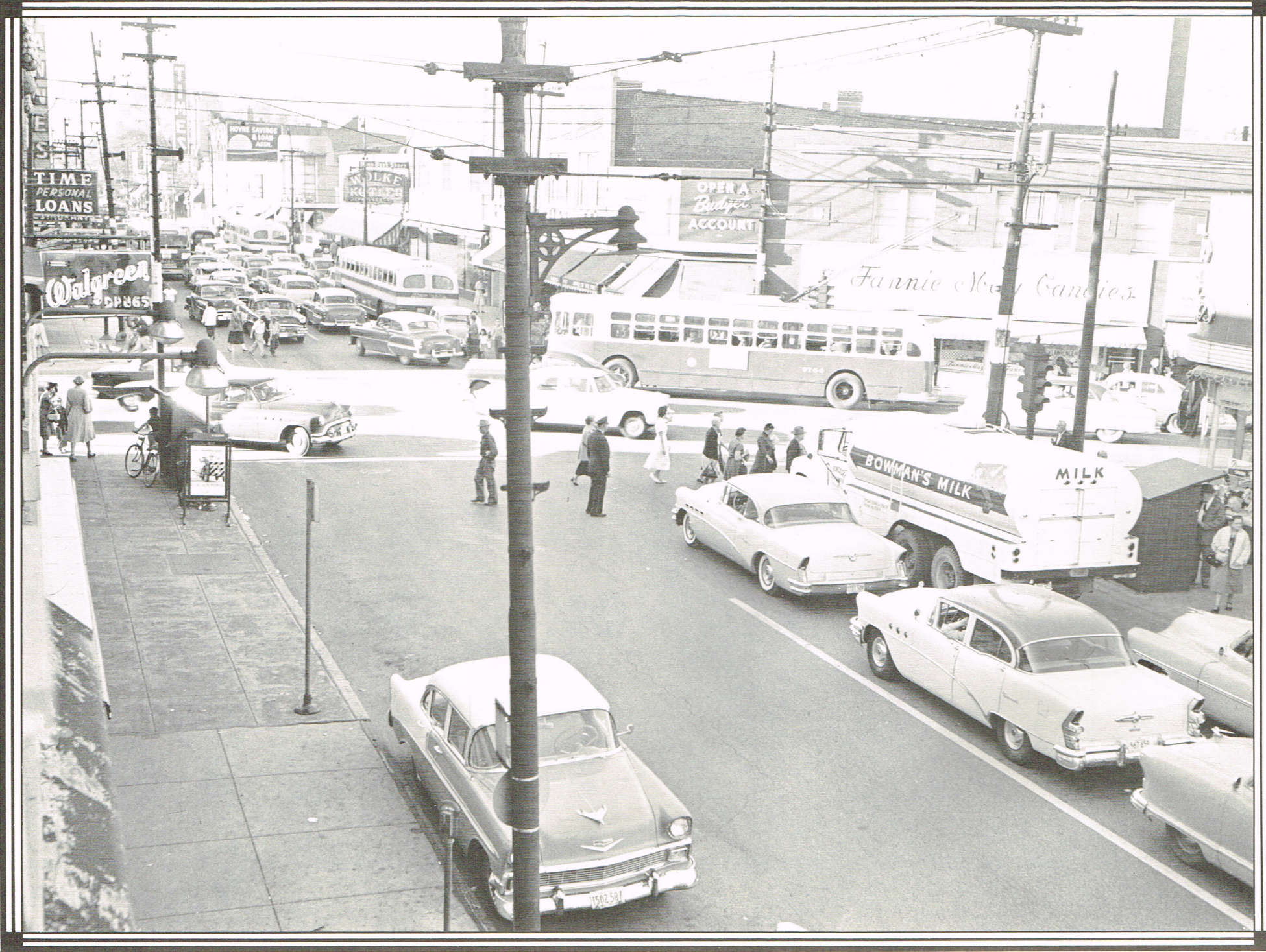
The Marmon-Herrington trolley bus, shown westbound on Lawrence at Milwaukee Avenue in 1956, seated 49 passengers, and was part of an order for 349 delivered in 1951-52. Propane buses provided a smooth ride on Milwaukee, where streetcars had operated only four years earlier.