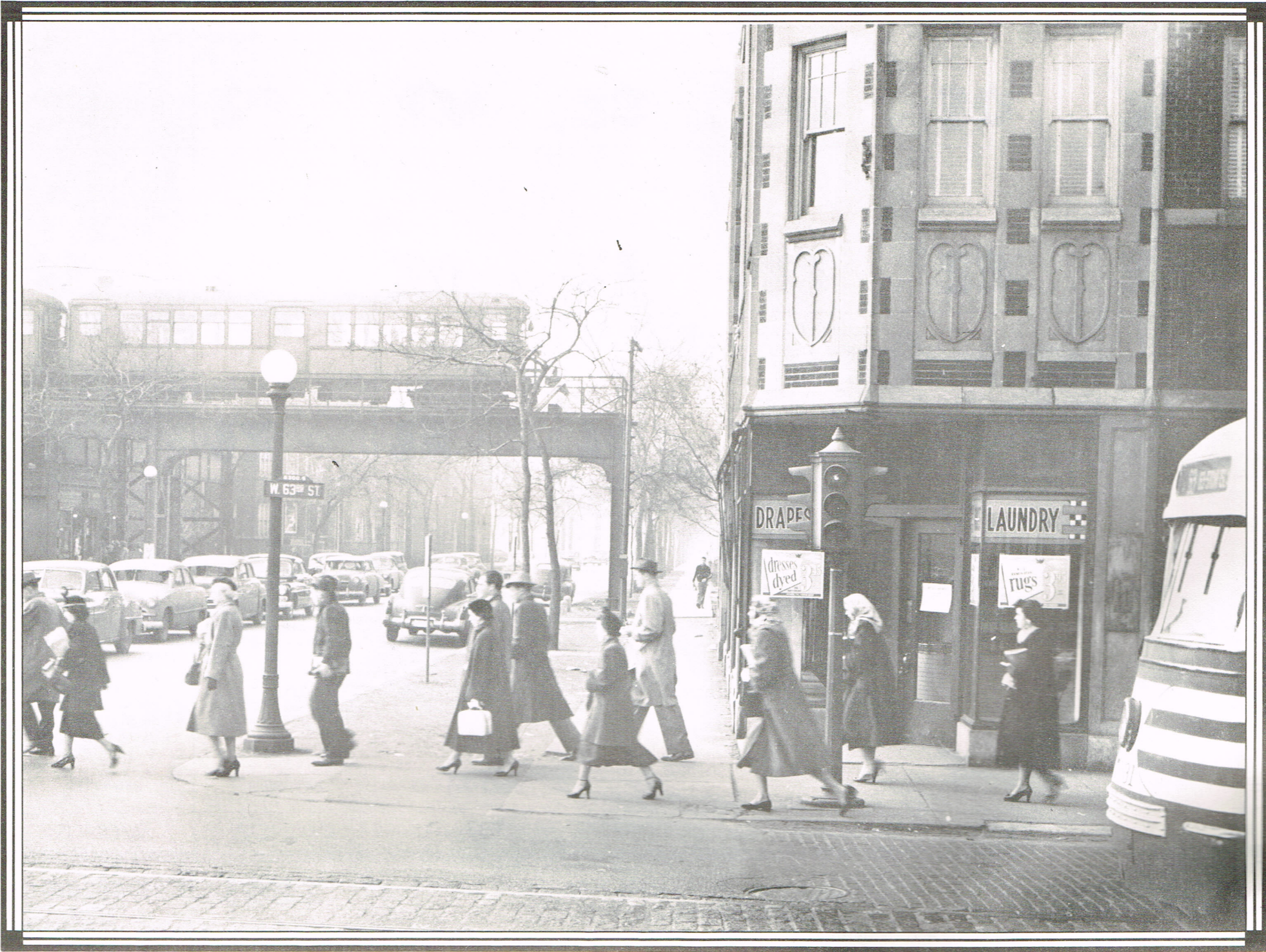
In this early 1950's view looking south from 63rd Street, a train with 1914-era "bowling alley" cars (inward-facing seats) waits to head north from the Englewood terminal at Loomis Boulevard, as riders hurry to make connections from an eastbound PCC "Blue Goose" streetcar.