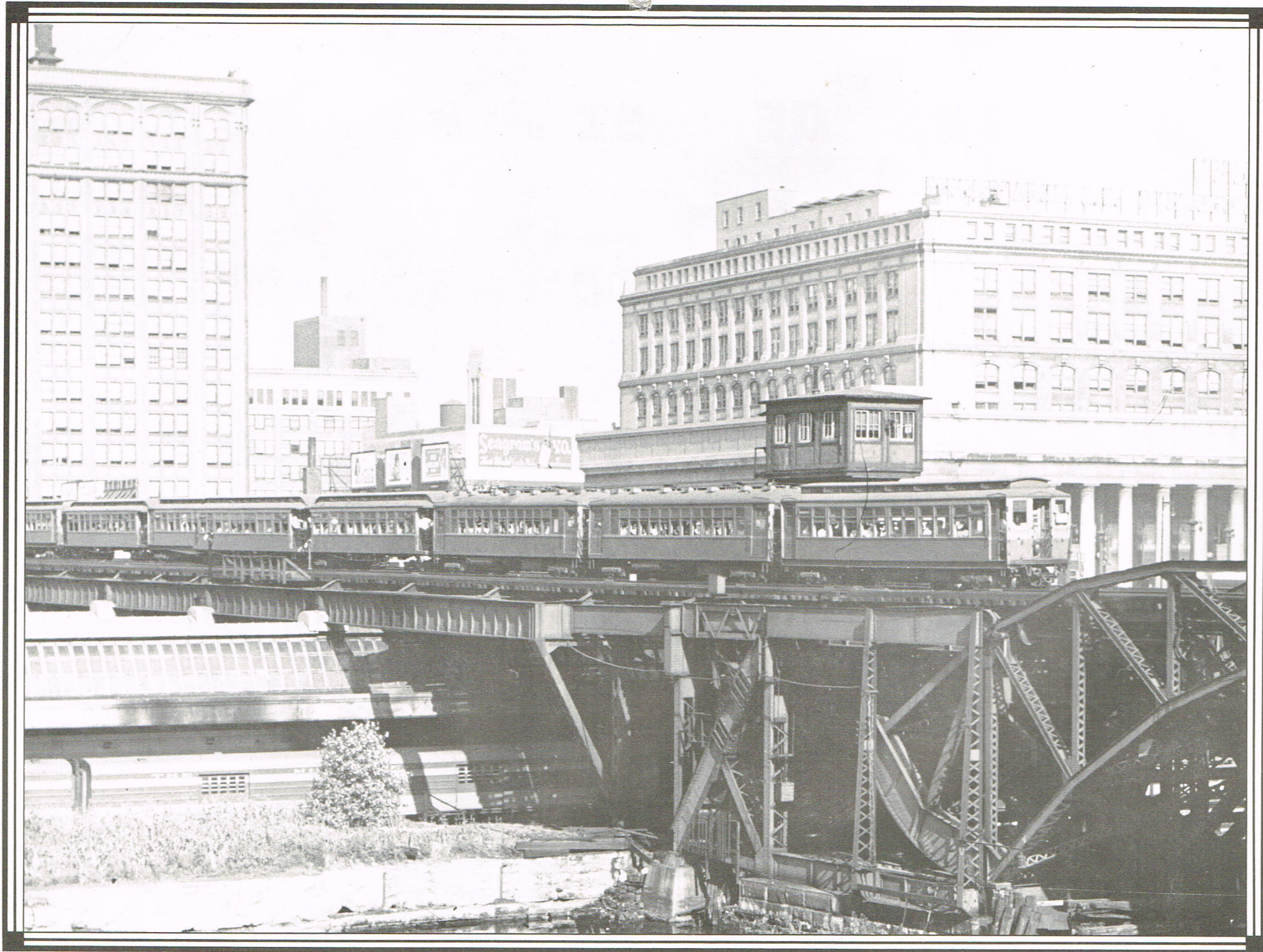
A five-car train carries morning rush-period riders across the four-track Metropolitan "L" bridge in this early 1940's view looking northwest toward Union Station. Leading two steel cars and two wooden coaches with open platforms is a 2800-series wooden motorcar built in 1906.