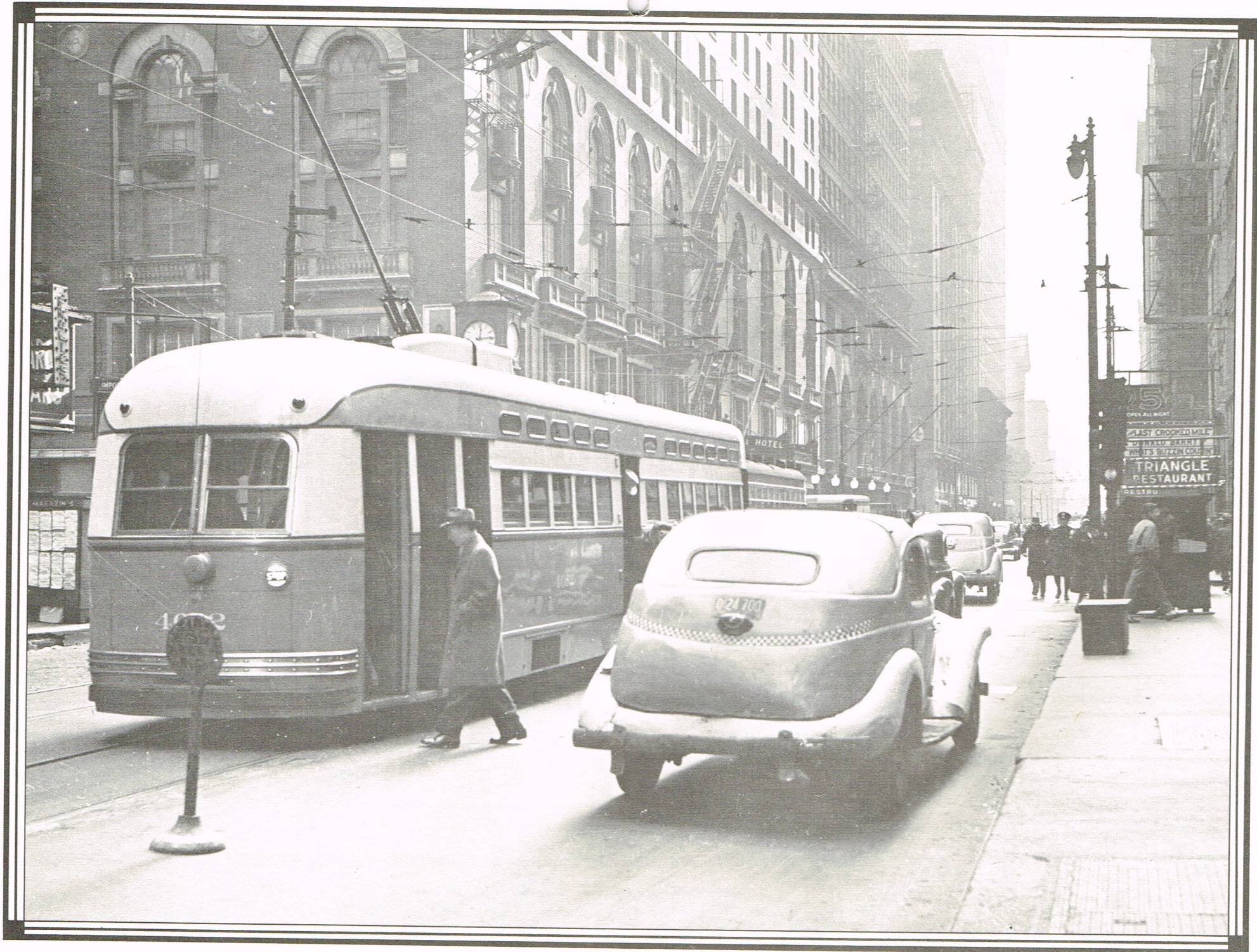
Pullman-built "Green Hornet" streetcar No. 4082 was still shiny new in this 1946 view looking south on Clark at Madison Street. Beyond the Clark-Wentworth car, which was heading to a terminal at 81st and Halsted, are the 45-story Morrison Hotel and the First National Bank.