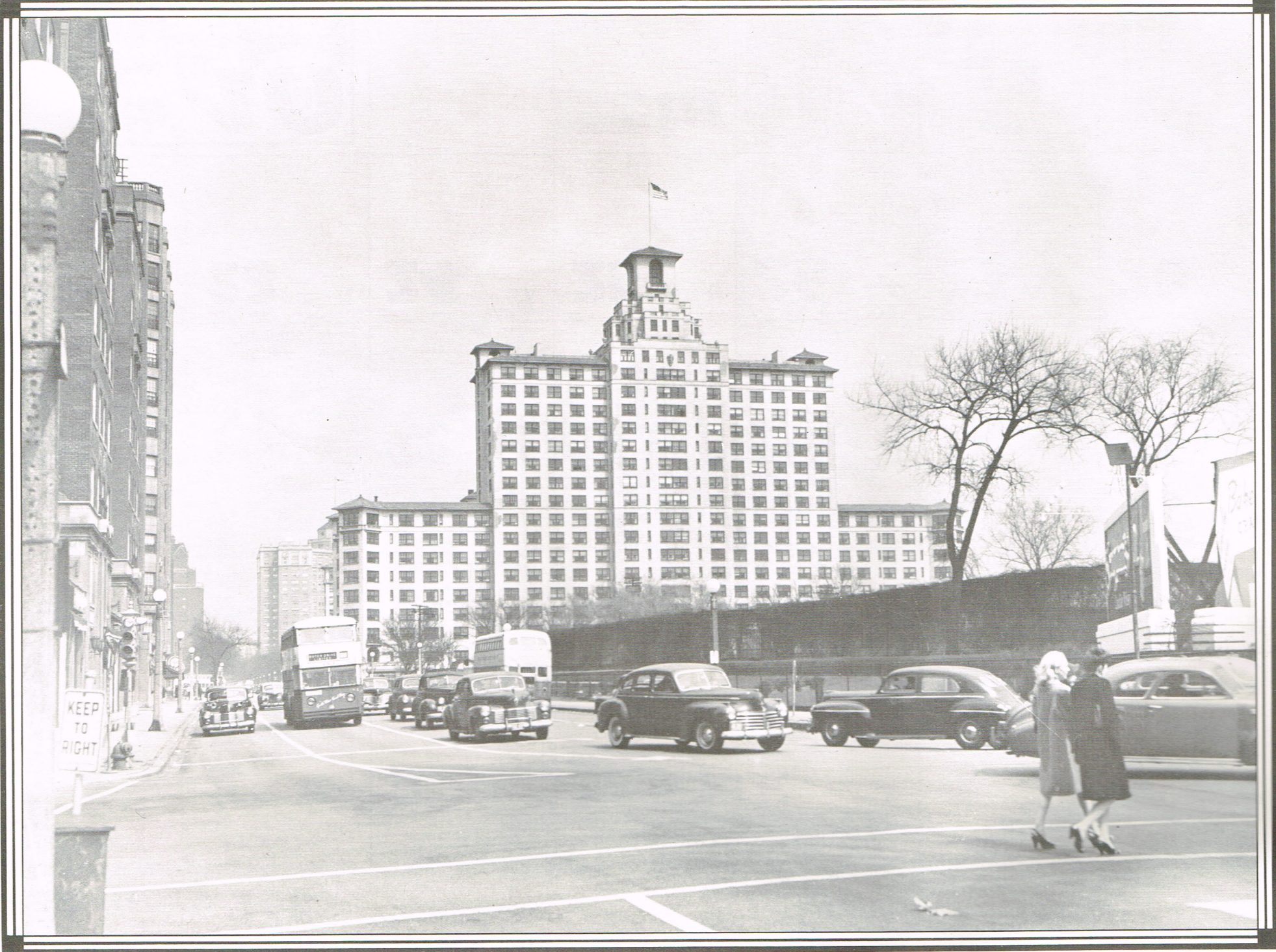
A southbound Outer Drive Limited prepares to turn east from Sheridan into Foster in the late 1940's, when Foster was still the northern limit of Lake Shore Drive. The northbound Chicago Motor Coach bus may have been a No. 51 Sheridan local, which also used double-deckers.