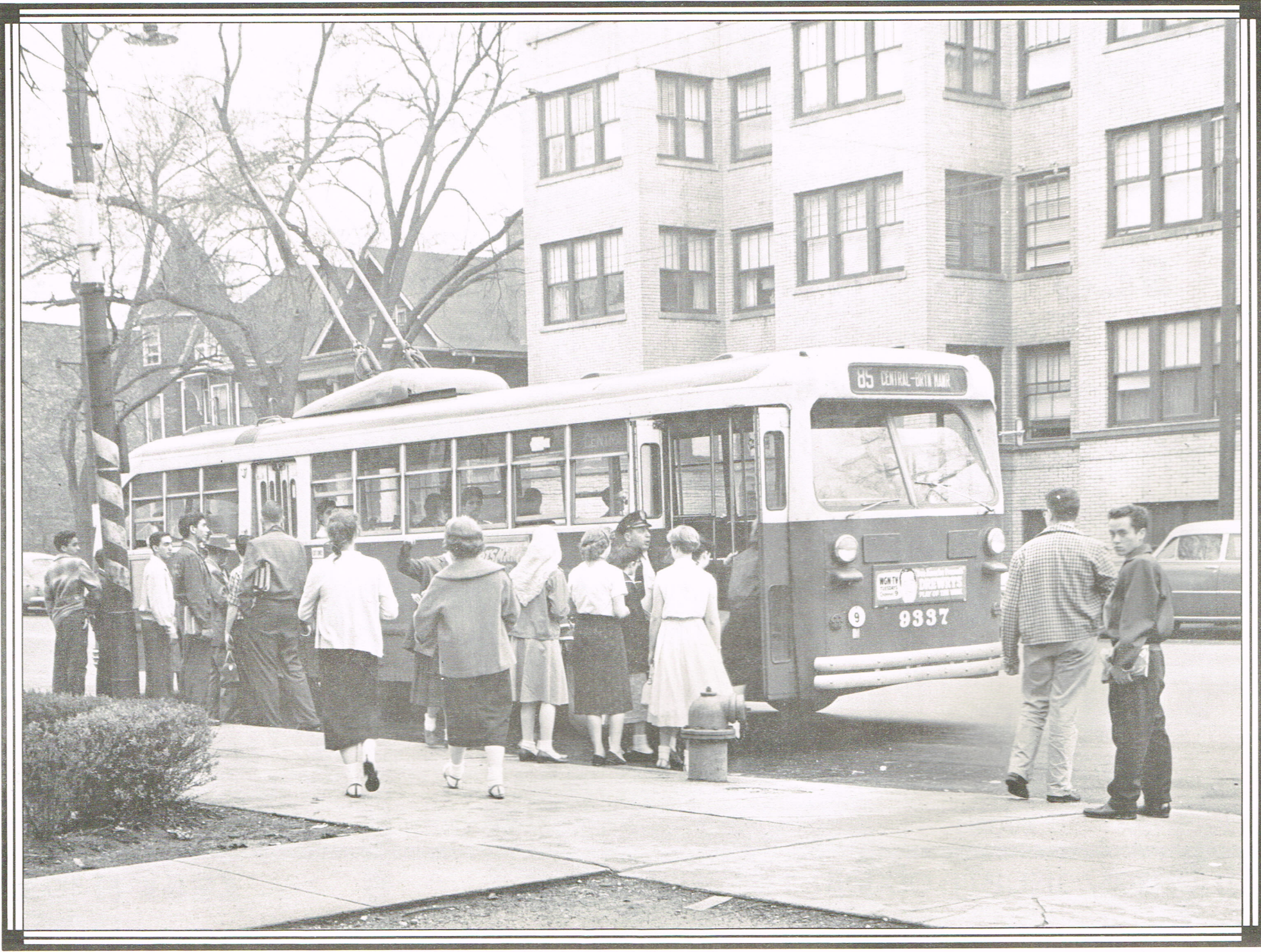
In 1957, loaders helped Austin High School students board northbound Central buses at Fulton. No. 9337 was among 45 Pullman-Standard trolley buses delivered to CTA in 1948. The 79 buses required for service on Central during peak hours were the most needed on any trolley route.