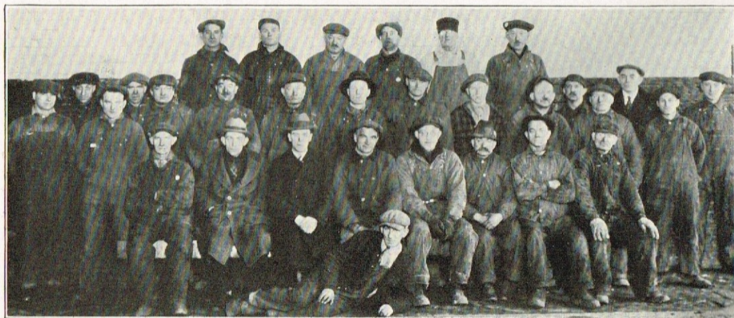
Again Leaders in Pull-in Contest