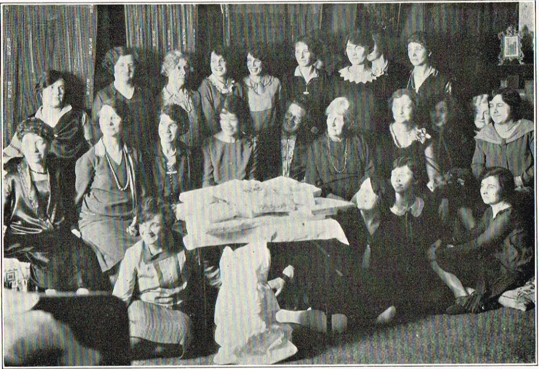
This Shower Was Dry