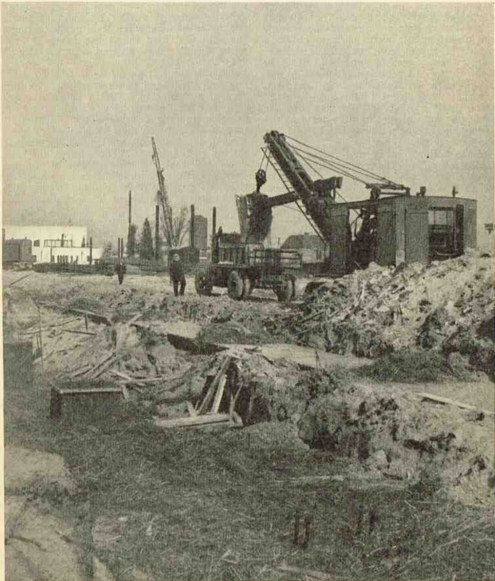
IT WON'T BE LONG NOW—WORKMEN AT FAIR CLEARING SITE OF FORD BUILDING