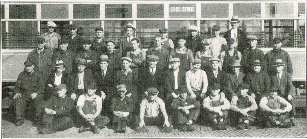
Burnside Pull-In Crew

Burnside Ranks First in August Contest, Lawndale Is Second and Blue Island Third