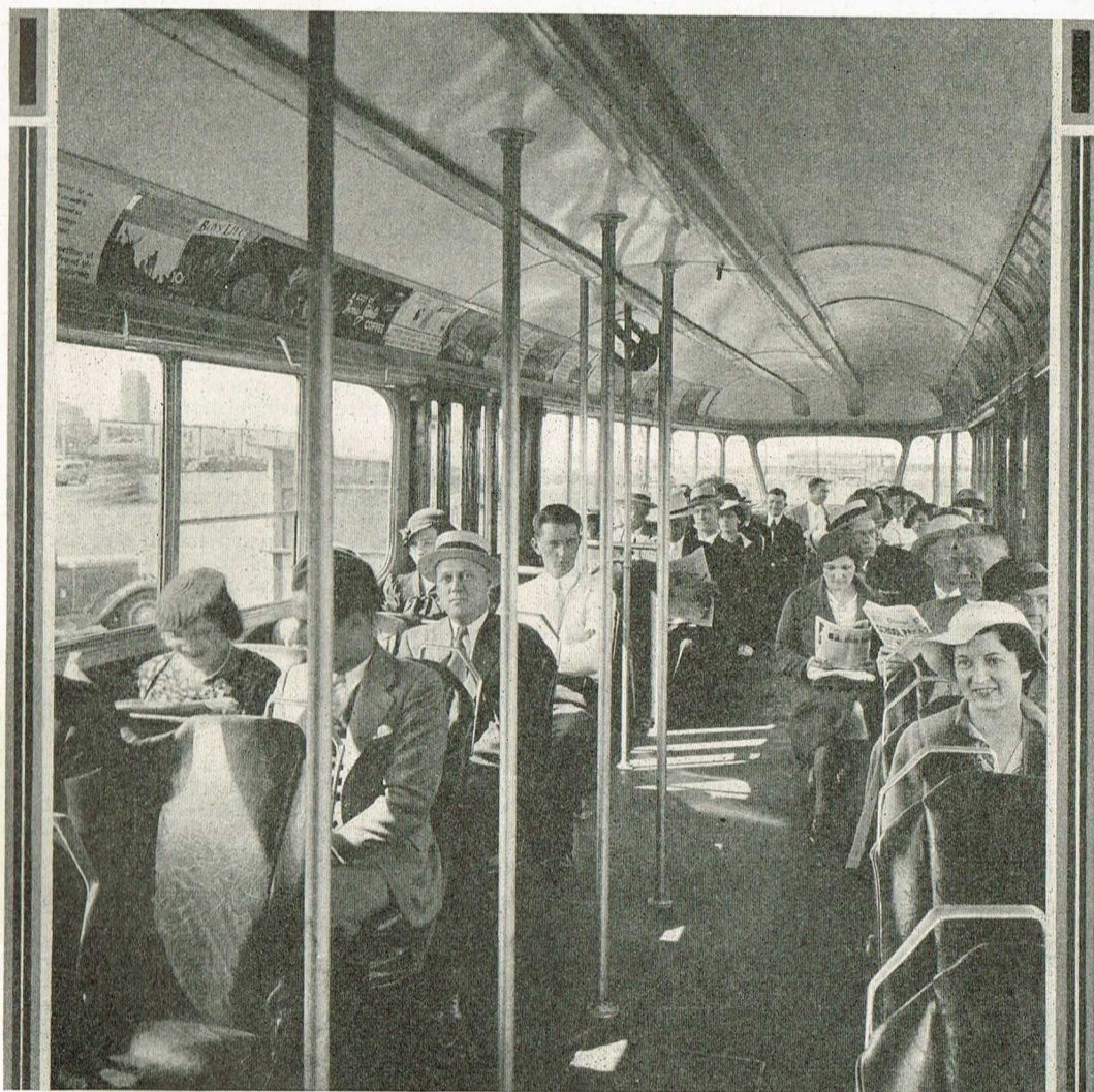
ATTRACTIVE INTERIOR ARRANGEMENTS OF "P. C. C." MODEL CAR BEING TESTED BY SURFACE LINES ENGINEERS