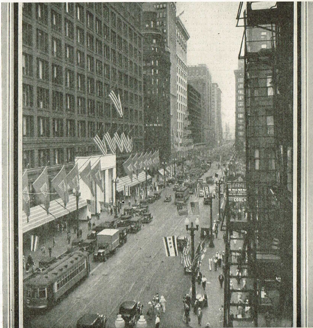
STATE STREET WHERE THE CROWDS GATHERED DURING HOME COMING WEEK