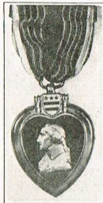
The Purple Heart Medal.

As they were pressing forward their officers discovered an enemy machine gun nest on their left flank that was doing serious damage and Beyer and two other privates under a non-commissioned officer was ordered to circle the nest and clean it up. The cleaning was thoroughly done, the five men working the guns being shot down at their station. One of Beyer's companions, Private Sheridan, was killed but the others were on their way back to their command when a burst of shrapnel tore through Beyer's right side and he was definitely "out." He was in the hospital from Oct. 5 till the following February when he was able to leave for home, the Armistice having put an end to hostilities.