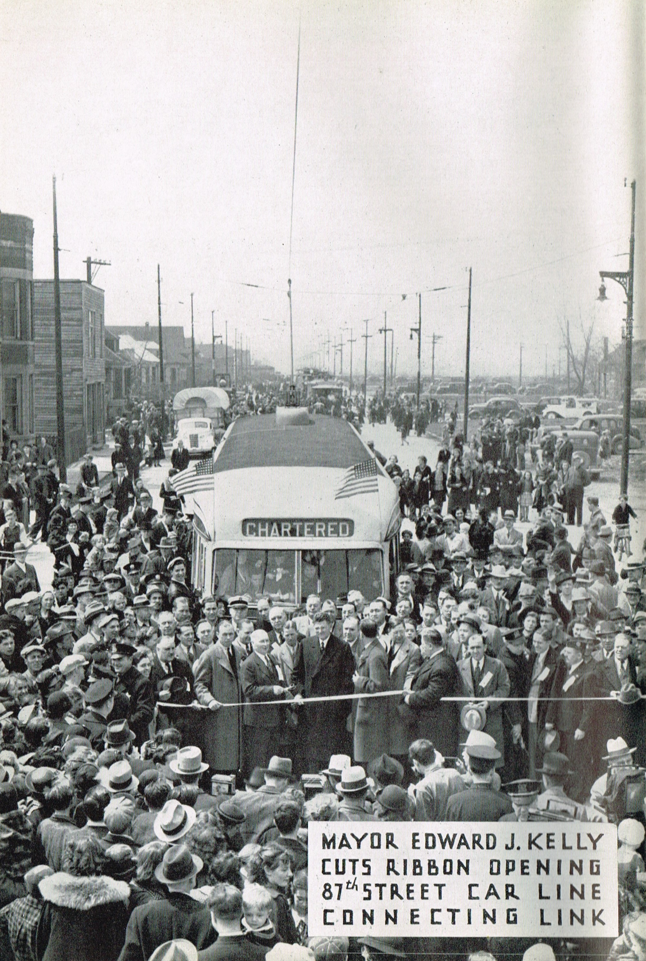
MAYOR EDWARD J. KELLY CUTS RIBBON OPENING 87 th STREET CAR LINE CONNECTING LINK