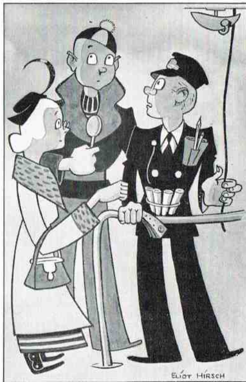
One and a half, please!