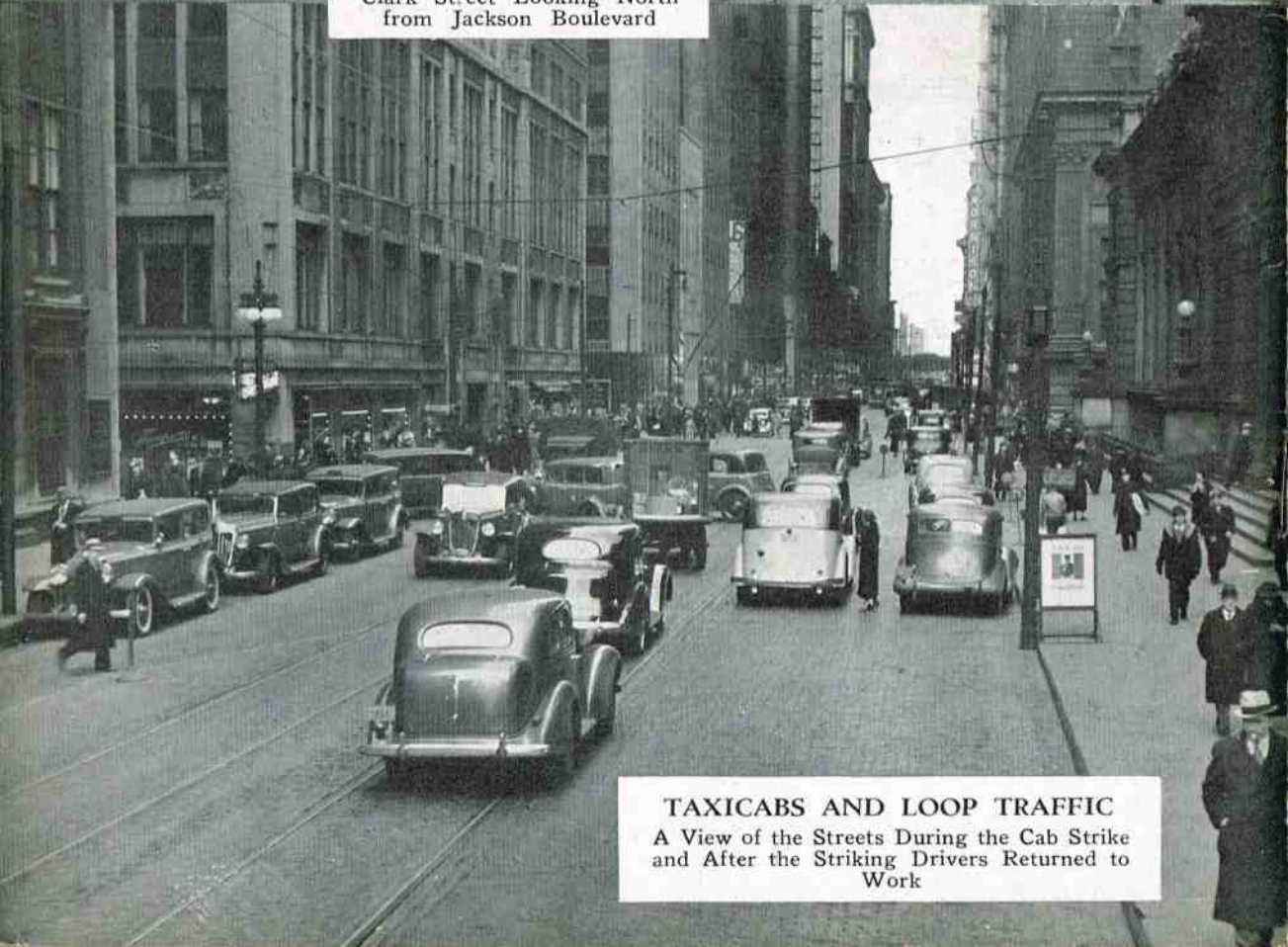
TAXICABS AND LOOP TRAFFIC A View of the Streets During the Cab Strike and After the Striking Drivers Returned to Work