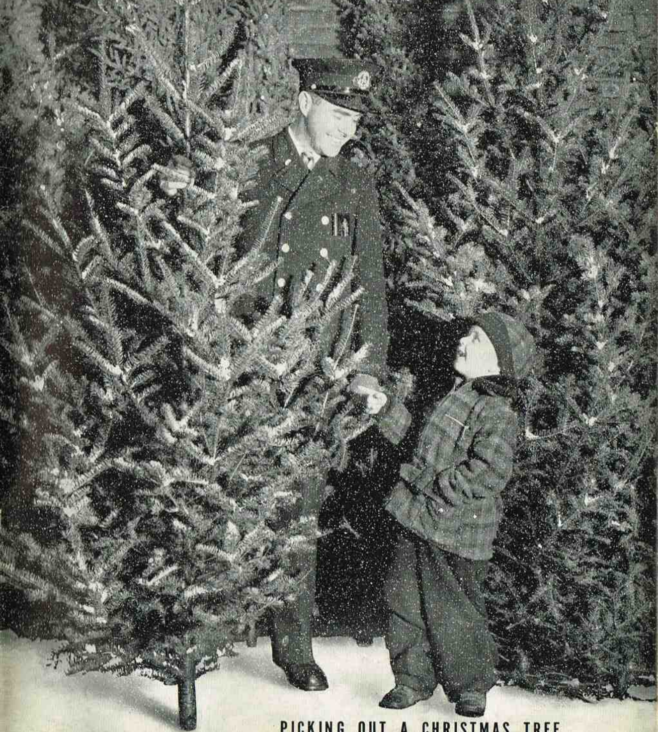
PICKING OUT A CHRISTMAS TREE