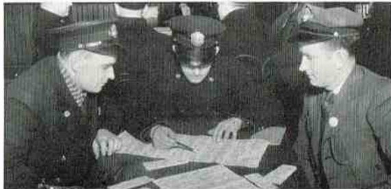
Study Makes for Easier Transfer Handling

of some motormen who use their air brakes while still running on full power or who "fan" the controller or who run on resistance points. Officials of the Surface Lines have shown a rising concern over the increasing power costs apparent through the last few years.