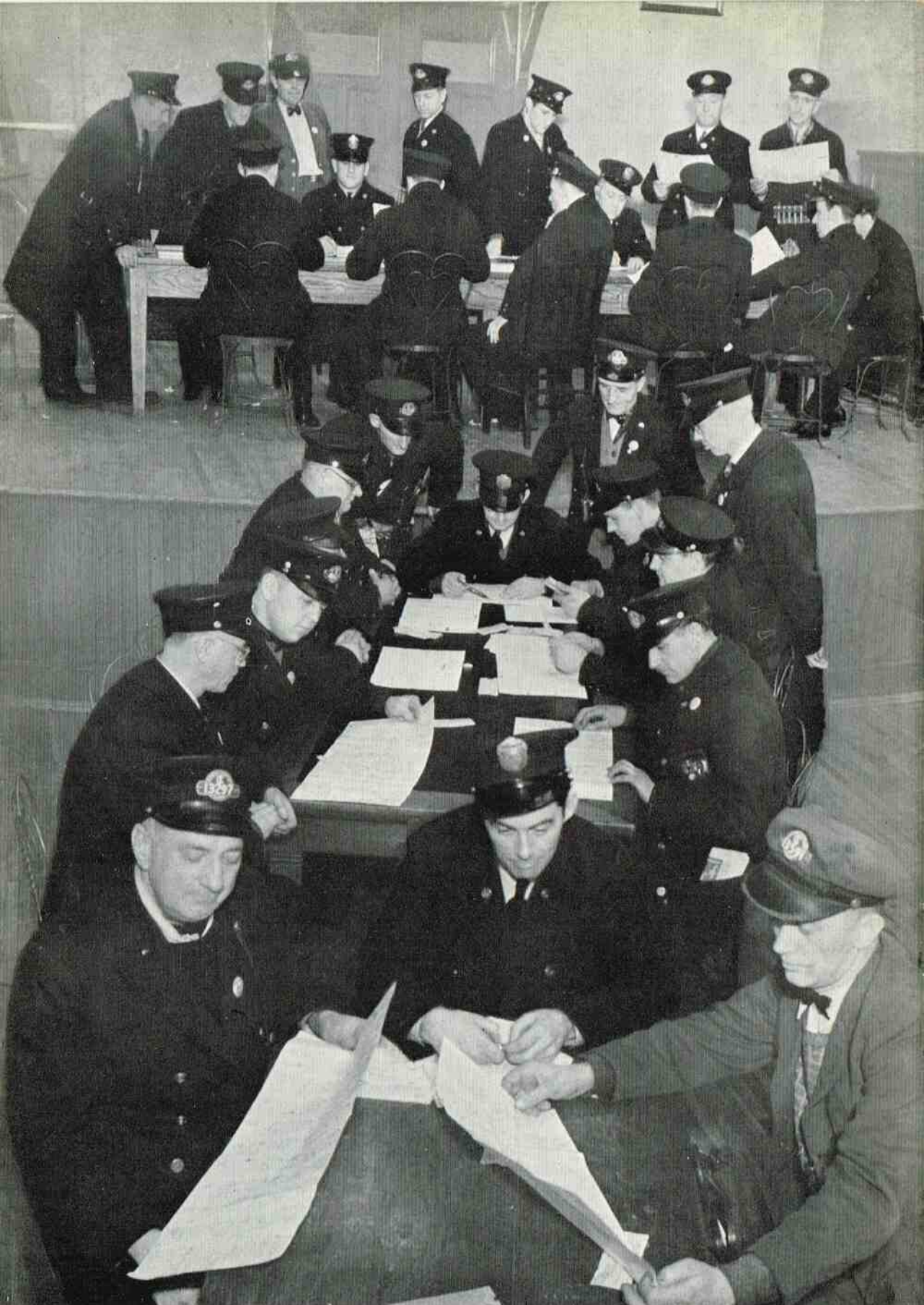
Conductors and operators, pitching in with a will at North Avenue, find transfer study makes for easier transfer handling.