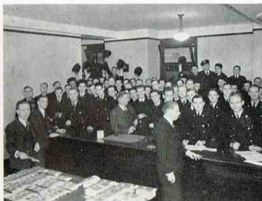
Mr. Hall Greets Returning Workers

The office of the Transportation Department was a busy place and filled with happy men when the 76 reported for work. The accompanying illustration shows the hilarity with which the men greeted prospects to return to the Chicago Surface Lines ranks.