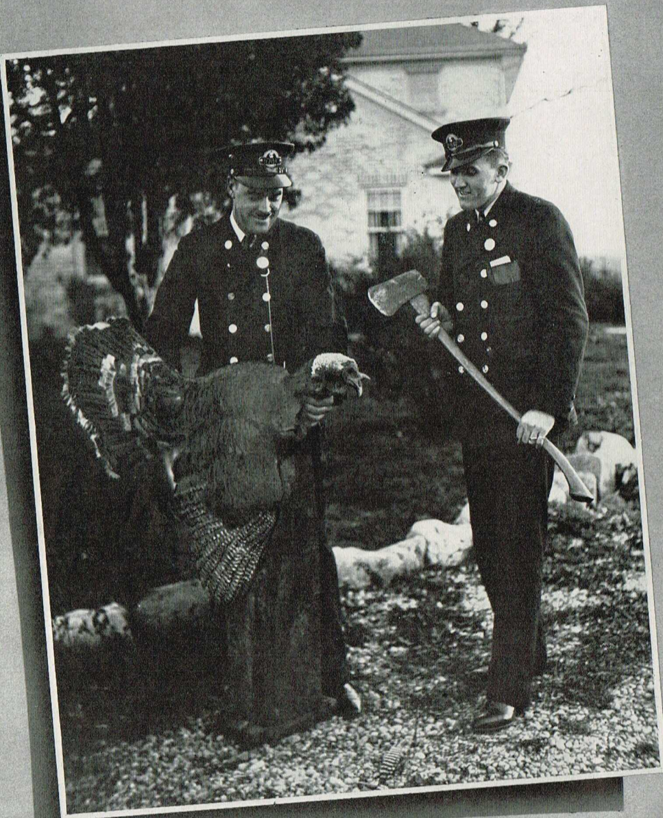
Photographer Fred Chouinard—the old turkey fancier—snapped this picture as a symbolic scene for a November issue. It's his way of hoping there will be a turkey in the oven of every Surface Lines family on Thanksgiving Day.