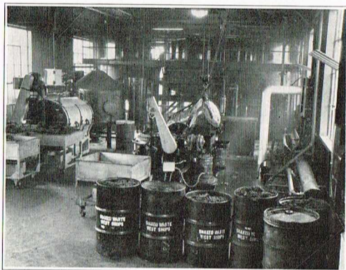
The above view shows a portion of the waste cleaning shop recently installed in the West Shops.

maining in the waste fibre after the first washing step.