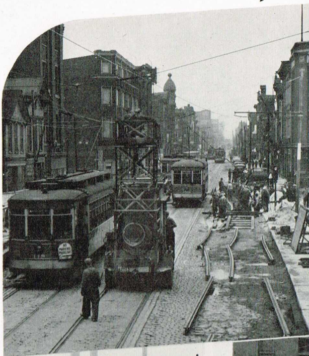
Milwaukee at Augusta