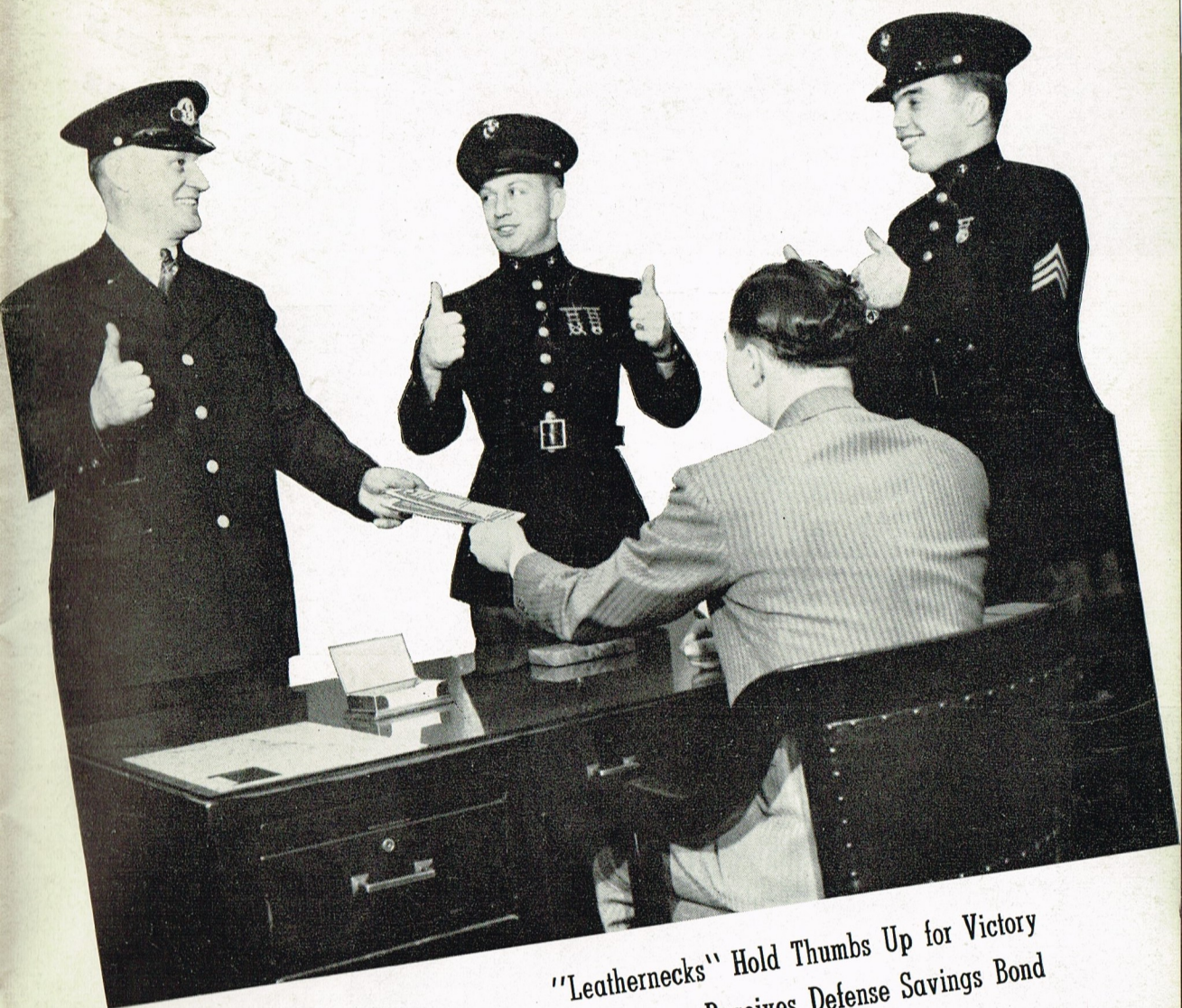
"Leathernecks" Hold Thumbs Up for Victory as Trainman Receives Defense Savings Bond