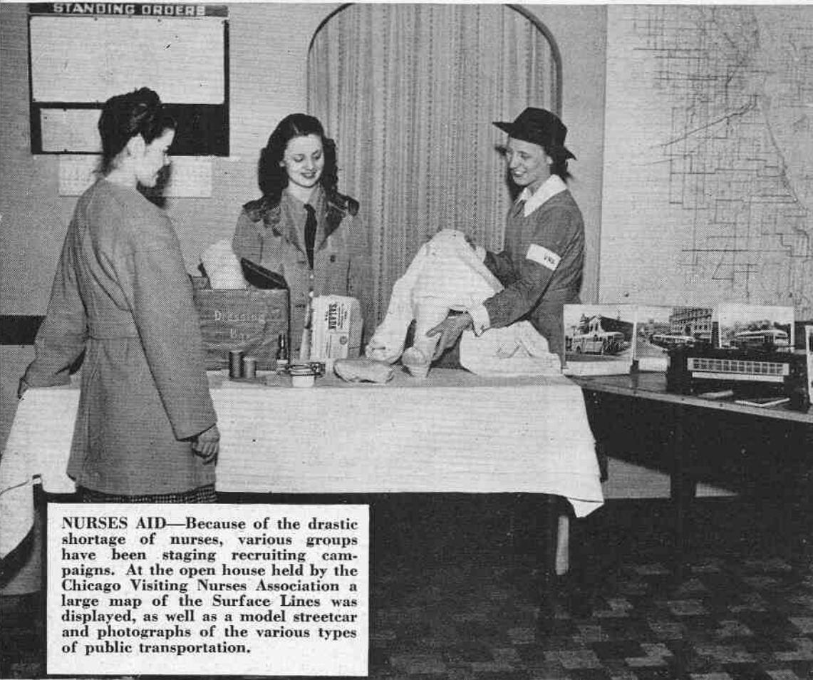
NURSES AID —Because of the drastic shortage of nurses, various groups have been staging recruiting campaigns. At the open house held by the Chicago Visiting Nurses Association a large map of the Surface Lines was displayed, as well as a model streetcar and photographs of the various types of public transportation.