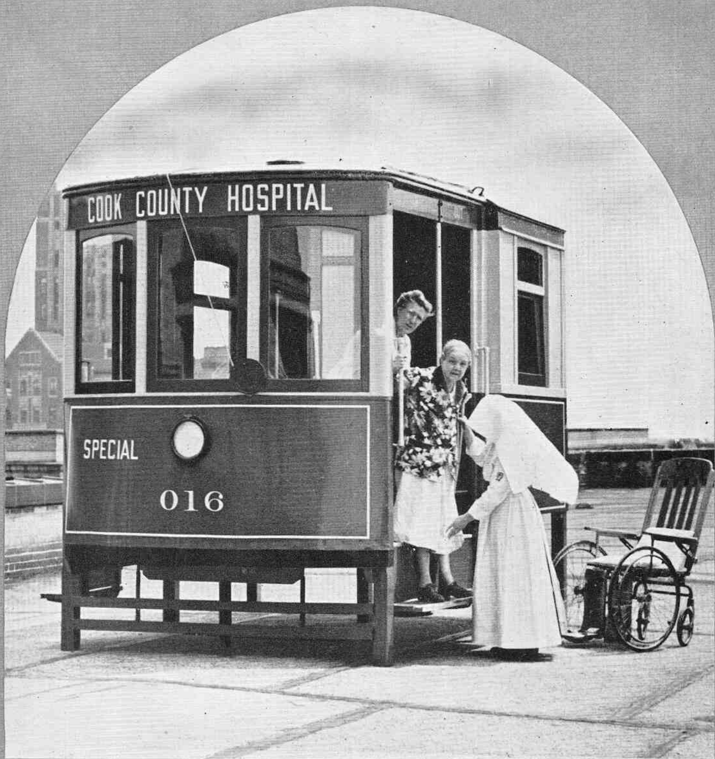
SURFACE SERVICE August 1947