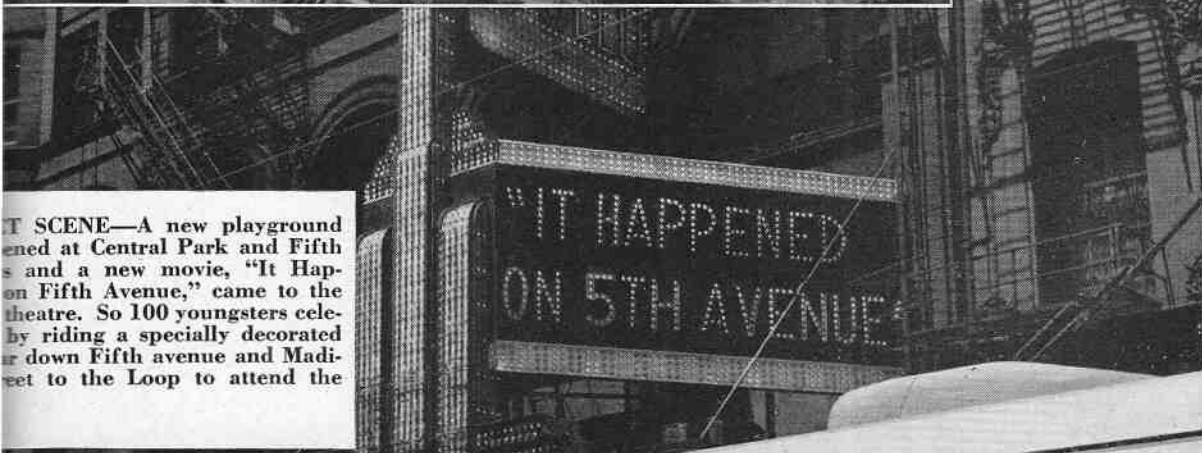
THEATRE SCENE —A new playground opened at Central Park and Fifth and a new movie, "It Happened on Fifth Avenue," came to the theatre. So 100 youngsters celebrated by riding a specially decorated trolley down Fifth Avenue and Madison to the Loop to attend the