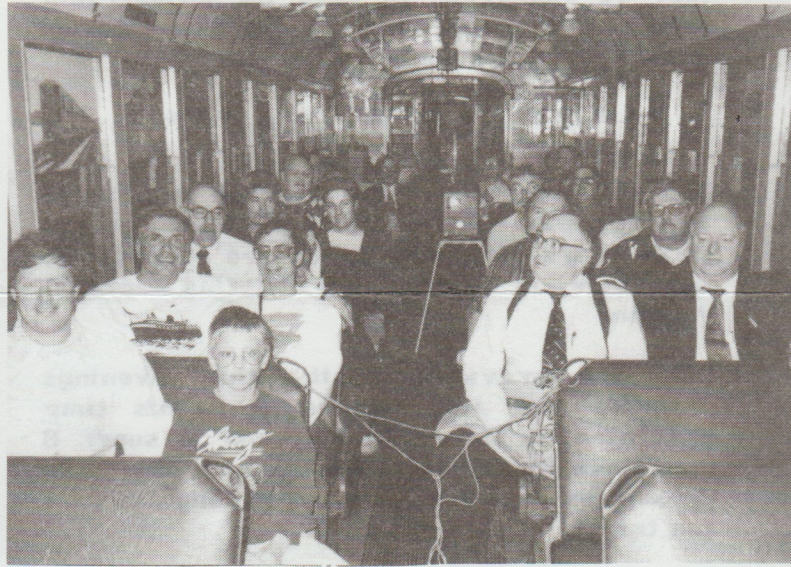
MEMBERS AND FRIENDS IN 4272 BEFORE SHOWING OF MOVIES