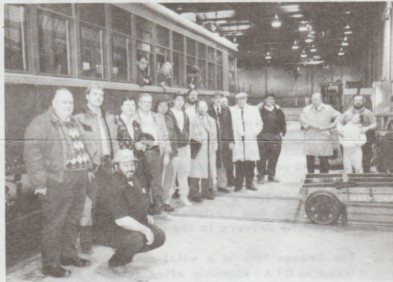
PICTURE OF MEMBERS OUTSIDE OF CAR 4271 BEFORE MEETING