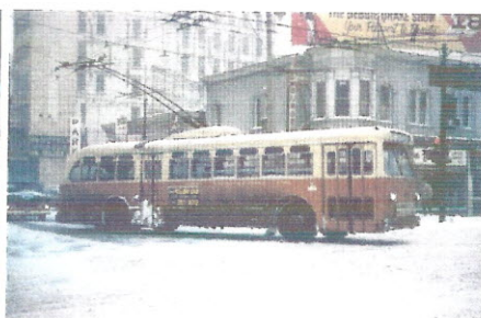
Transit properties of Wisconsin