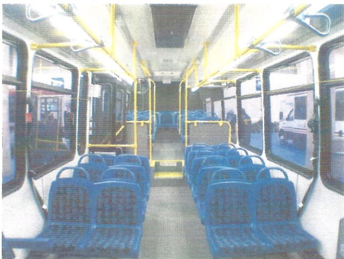
ElDorado Axess interior