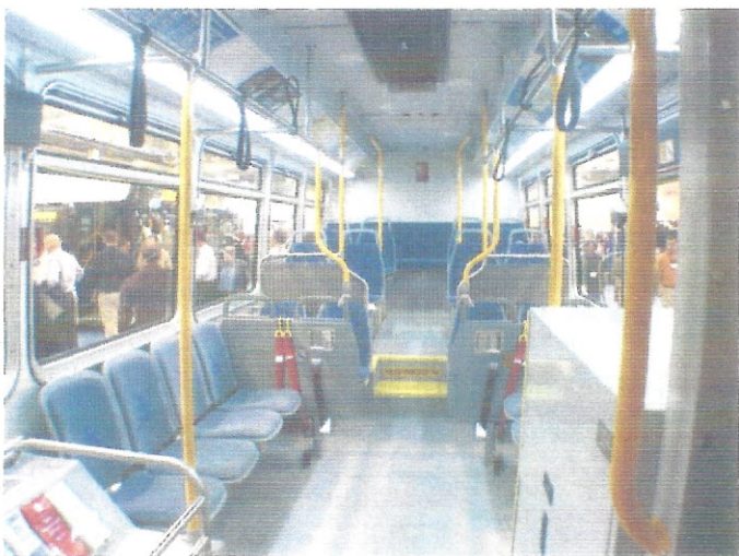
Interior of Pace 2602