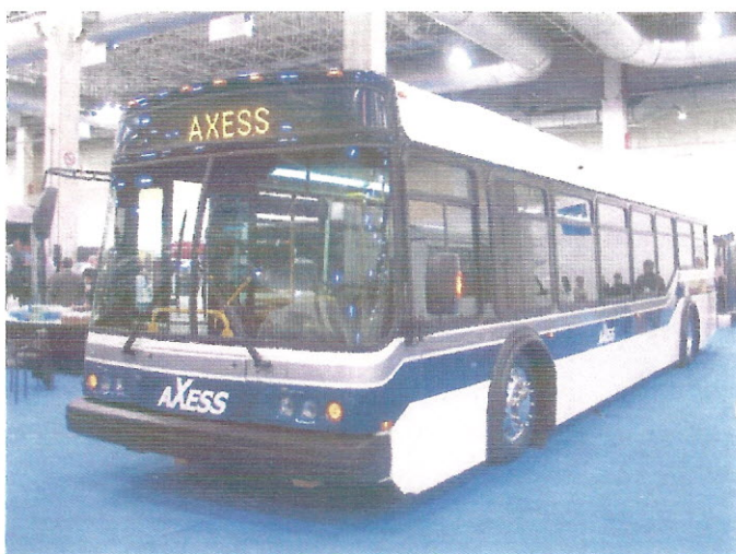
ElDorado Axess 40' low-floor bus