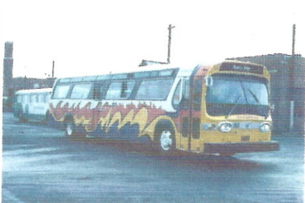
CTA Buses in Color