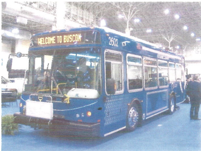
ElDorado EZ-Rider II Pace 2602