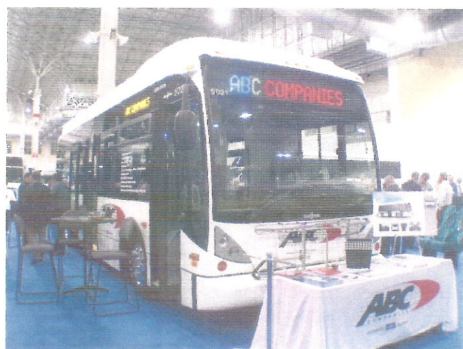
VanHool A300K AC Transit