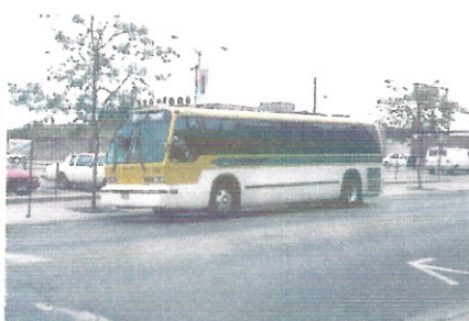
Transit in Northern Illinois