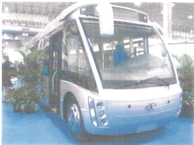
FAW/TAIHU Model CA6100SH2 Chine bus