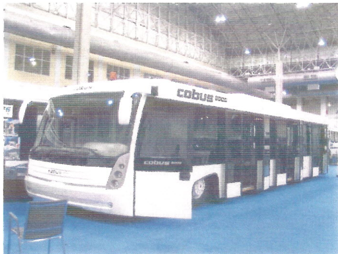
Cobus airport ramp shuttle