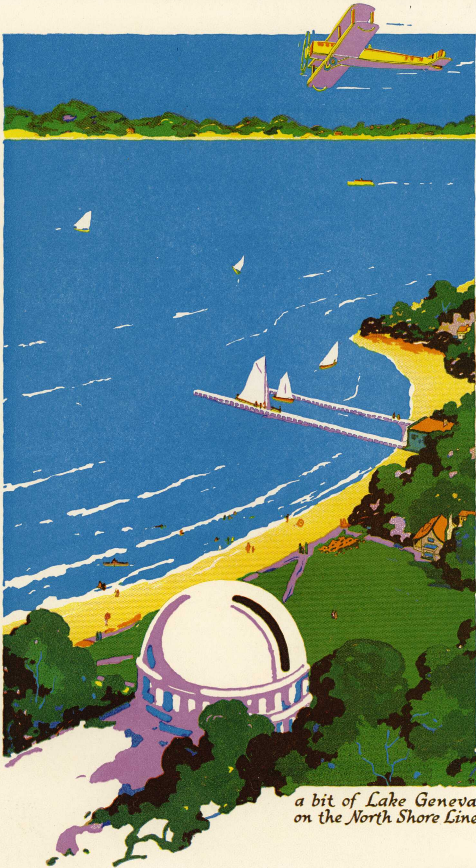
a bit of Lake Geneva on the North Shore Line