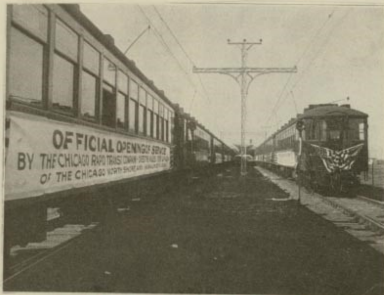
Two of the Special Trains to the Niles Center Opening Ceremonies

Opening of Skokie Valley Line to Niles Center March 28, 1925