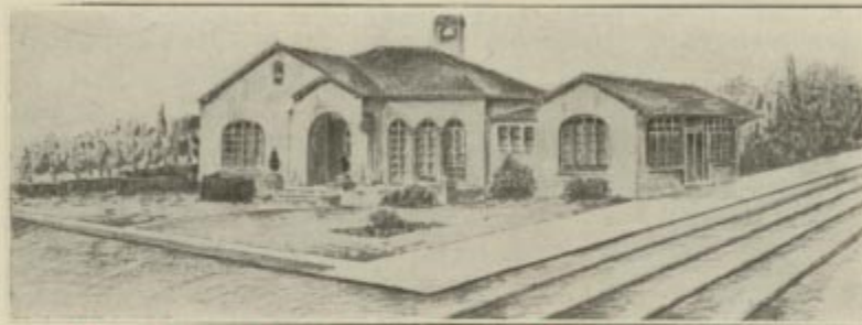
Architect's drawing of the attractive mission style stations on the new Skokie Valley Line.

The Skokie Valley right of way is owned by the Company, is double tracked and has steel catenary construction its entire distance.