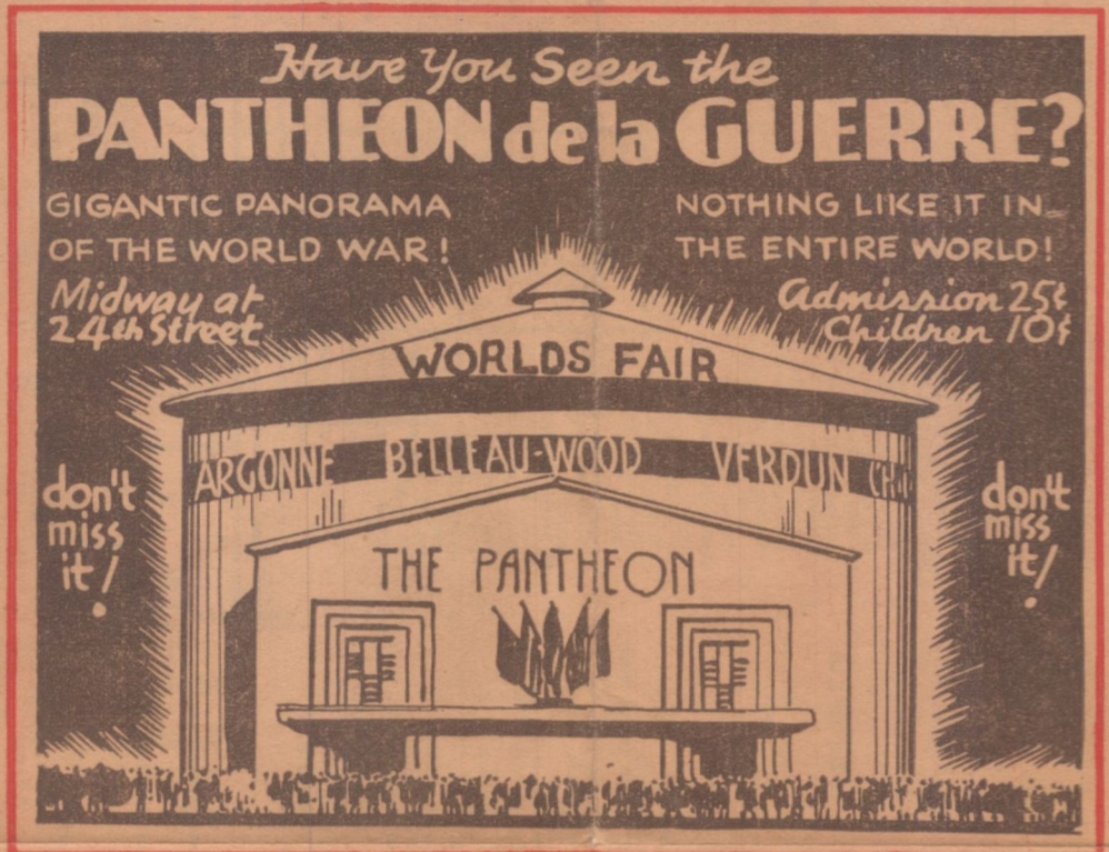
ON THE MIDWAY AT 24th STREET

Brought to America from Paris at great expense by American patrons of art, the Pantheon de la Guerre, famous world war panorama, is one of the outstanding attractions at the World's Fair. It is the work of 130 noted artists who toiled, often under shell fire, from the opening of hostilities in 1914 to the signing of the armistice in 1918 to complete the great masterpiece. It depicts accurately the battlefields of France and Belgium with life-size figures in the foreground of 6,000 leaders, statesmen and heroes of the twenty-four nations which fought on the side of the Allies. It is the largest historical panorama in the world measuring 402 feet long and 50 feet high. It weighs 12½ tons when packed in a huge metal lined box for shipment. This famous spectacle will be returned to Paris at the close of the World's Fair. It was viewed by more than 8,000,000 persons in the French Capital before being shown in America. All who have seen the Pantheon de la Guerre pronounce it the most dramatic, gripping and artistic production at the Fair.