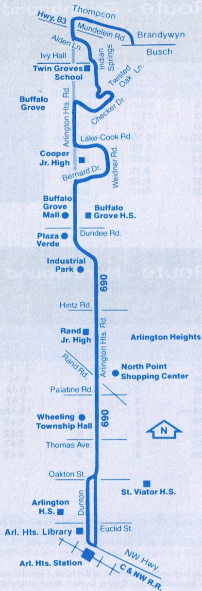
Rush Hour Route