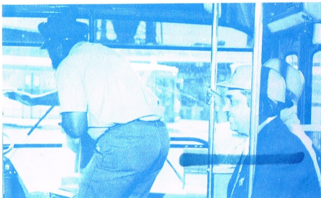
PRACTICE BUS OPERATION