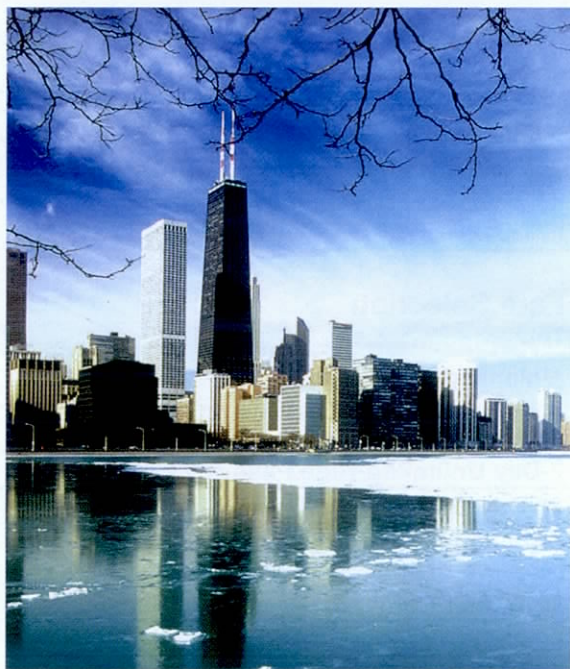
Wintery Skyline

CTA buses and trains are a great way for groups to see all of Chicago.