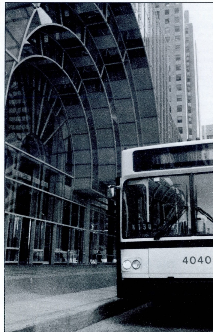
NEW Bus Route #130